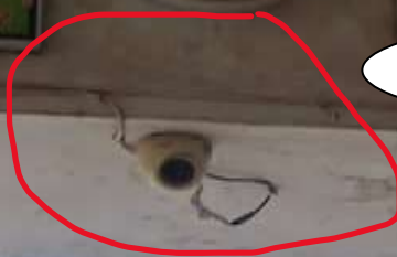
CC TV Camera

To become a valuable institution we produce a well-learned leaders of the national and international position with constructive learning and research according to world trends. Mission 01. Aids in translate collective dreams of the Community of the region to reality. 02. Create, disseminate and inter disciplinary and collaborative researches. 03. Educate and train the Human Resource persons for the development of the State of Chhattisgarh. 04. To advancement of intellectual, academic, cultural and natural resource development for Socio-economic development of the region. 05. Appropriate measures to promote quality education to the students.